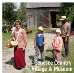
Genesee Country Village & Museum

ARTISANWORKS - 40,000 square ft. of a renovated factory building integrates arts of all kinds; promotes regional artists through an art incubator program. The collection includes more than half a million items.